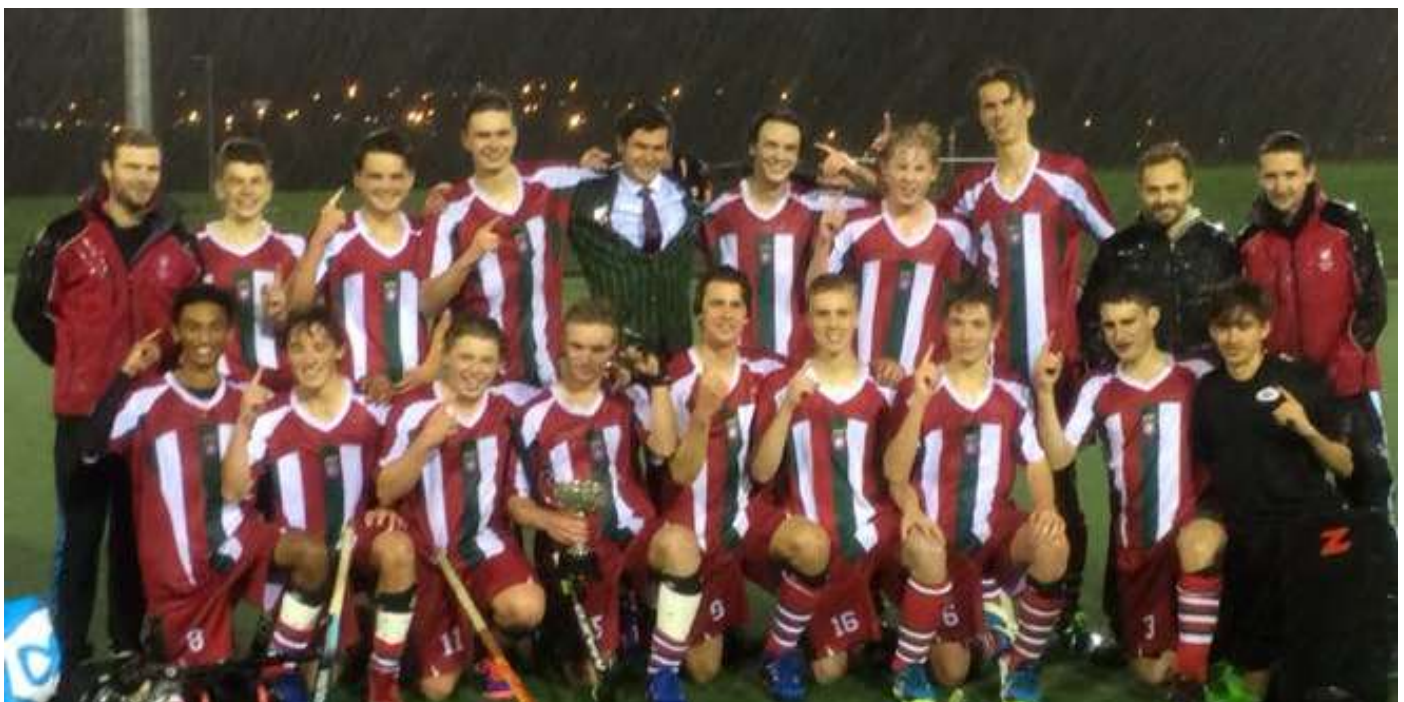
Westlake Boys High School 1st XI—Winners of the NHHA Boys competition with a 2-0 victory over Rosmini 1st XI