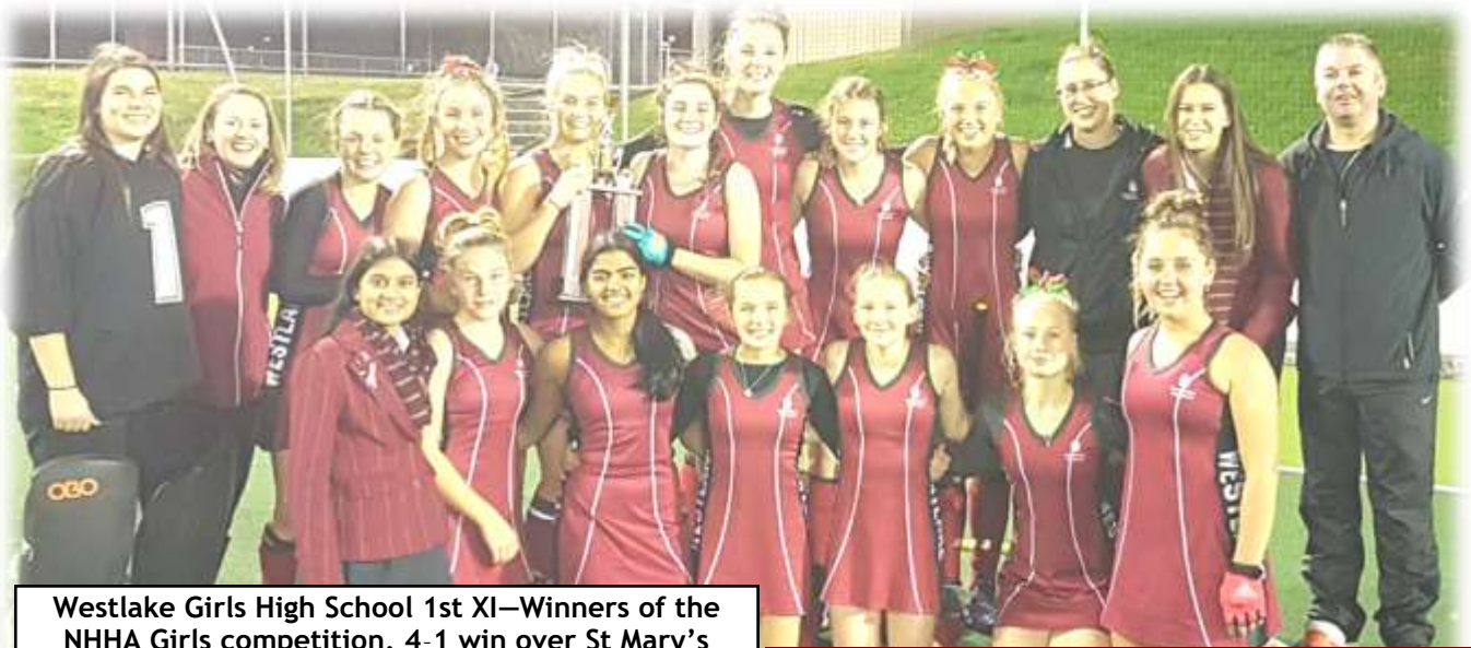
Westlake Girls High School 1st XI—Winners of the NHHA Girls competition. 4-1 win over St Mary's