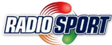
Sponsor of North Harbour Hockey Umpires