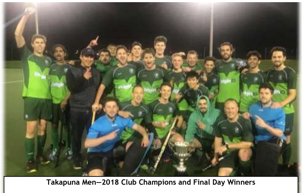
Takapuna Men—2018 Club Champions and Final Day Winners