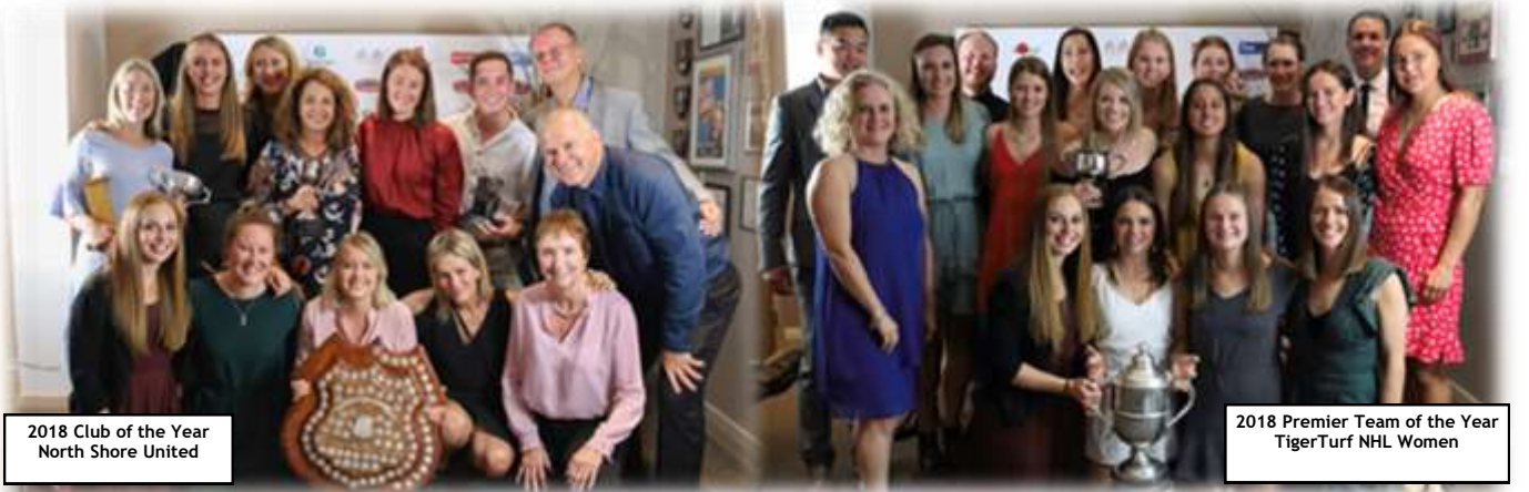
2018 Club of the Year North Shore United