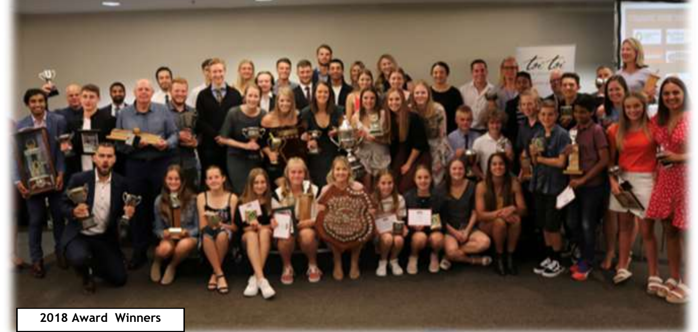
2018 Award Winners