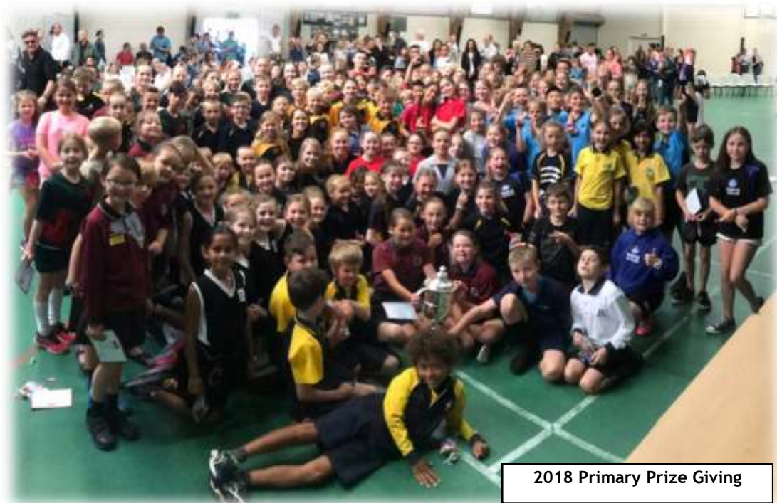
2018 Primary Prize Giving