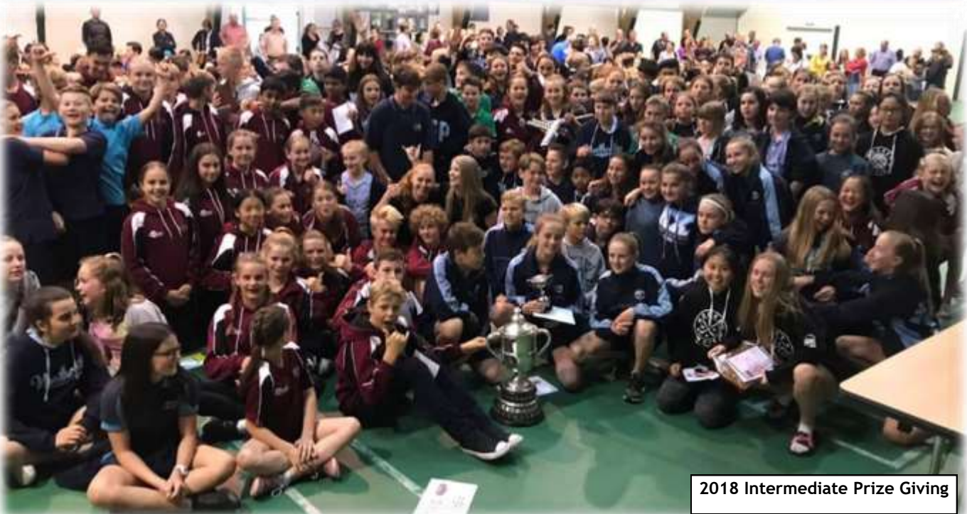
2018 Intermediate Prize Giving