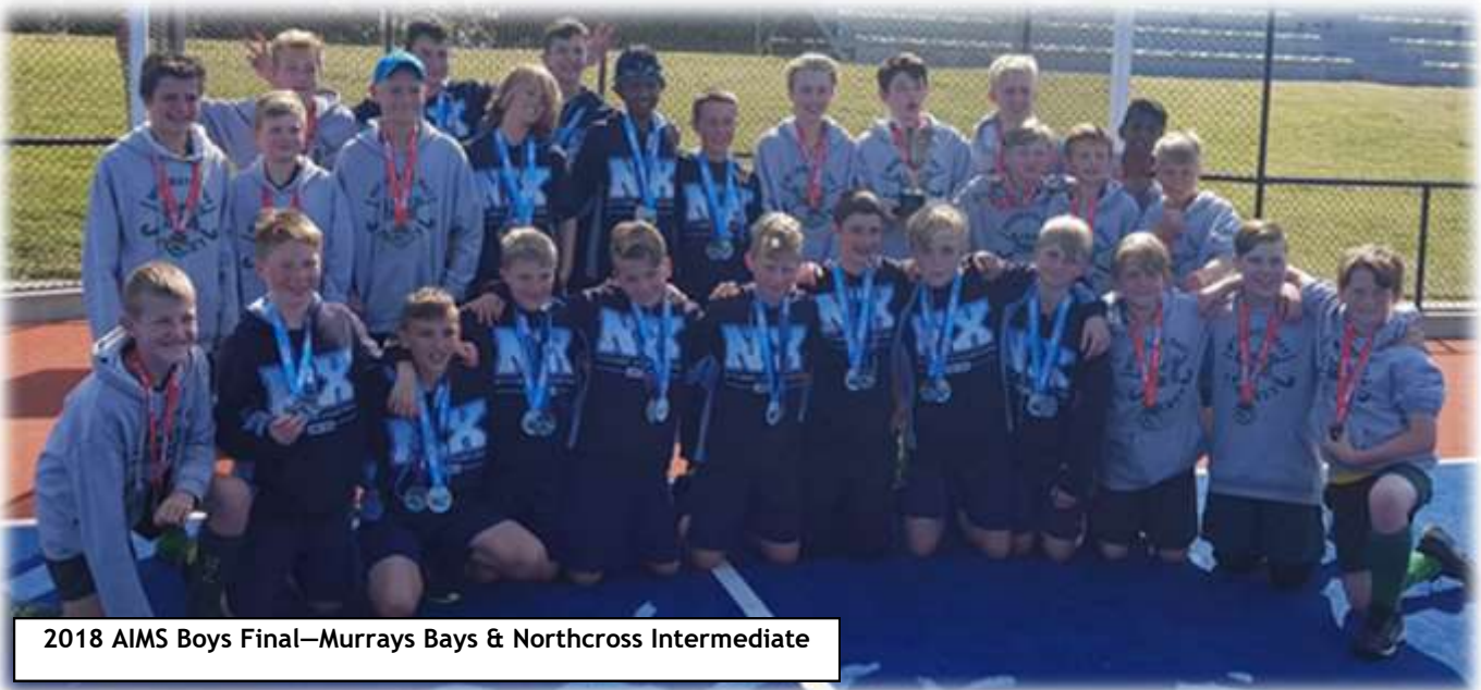
2018 AIMS Boys Final—Murrays Bays & Northcross Intermediate