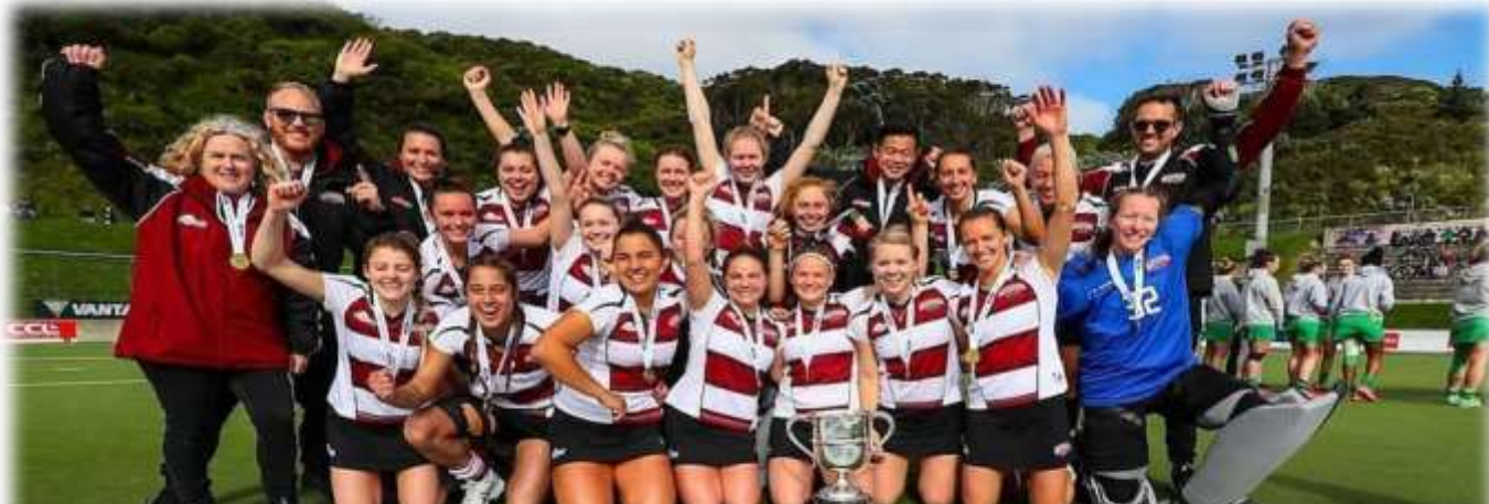
TigerTurf NHL Women (Hawks)—Winners of the 2018 Ford NHL with a 2-0 victory over Central