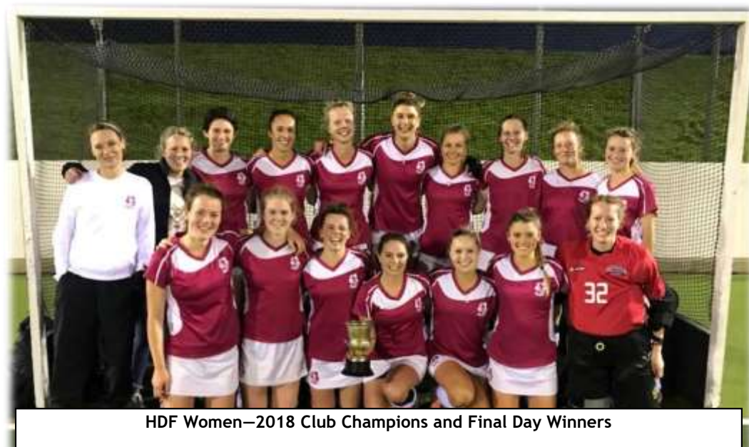
HDF Women—2018 Club Champions and Final Day Winners